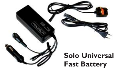
Solo Universal Fast Battery Charger SOLO 726