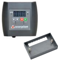
Scorpion Control Panel SCORP 8000 (including mounting box)