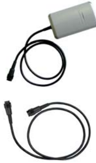
Scorpion Power Pack SCORP 50