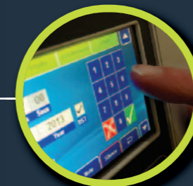
Powerful code-protected engineer functions