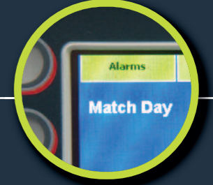
Multiple modes of operation