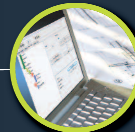
Powerful & intuitive PC programming tools