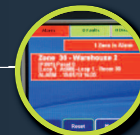
Clear indication of alarms across multiple panels