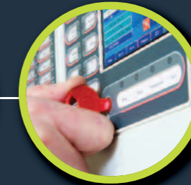
Simple keyswitch access for end users