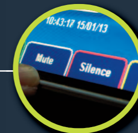
Silence and reset alarm conditions with ease