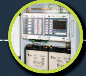
Up to 72 hours standby in standard cabinets