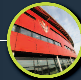
Installed in a host of prestigious sites