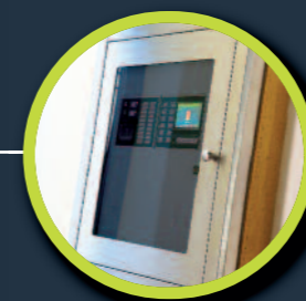
Wide range of bezels & stainless steel accessories