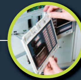
Fully interchangeable indicator modules