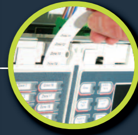
Customisable labels supplied free-of-charge