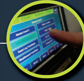
Everything you need at the touch of a button