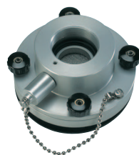
Duct mount flange