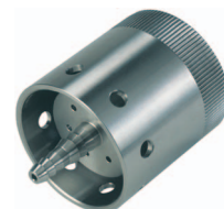
Weather protection cap