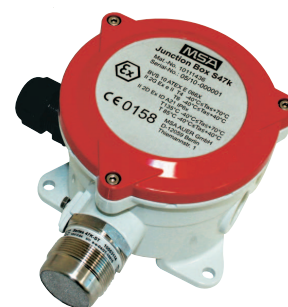
47K M25 x 1.5