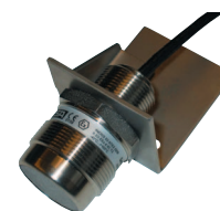
HT sensor and wall mount bracket