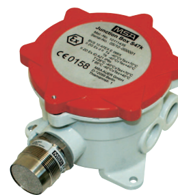
47K 3/4" NPT

The heat generated by the reaction increases the temperature of the detector, which results in a change of the detector electrical resistance, and hence an unbalance of the Wheatstone bridge. The result is an output signal directly proportional to the concentration of the flammable gas or vapour.